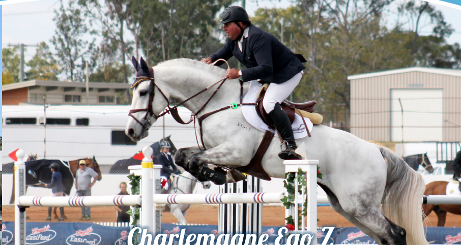
Charlemagne Ego Z