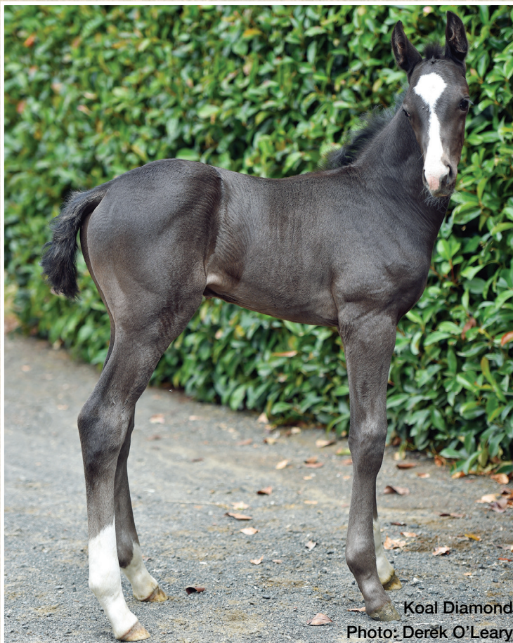
Koal Diamond