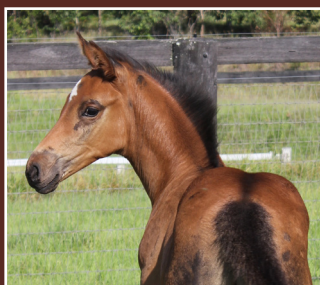
Christian x Clearway colt - SOLD