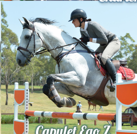
Capulet Ego Z