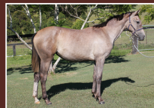
Hunter's Scendix x Cassini II filly - SOLD