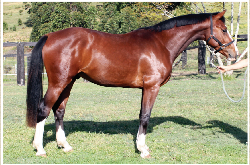
Another Cera bred youngster, the stunning Cera Charisma (Casall ASK x Carinjo) who will be standing at stud next season