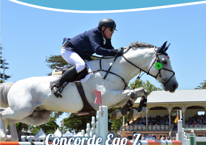
Concorde Ego Z

What do Charlemagne Ego Z, Capulet Ego Z, Concorde Ego Z, Cocaine Ego Z, Bravado Ego Z, Absolute Ego Z and Cartalme Ego Z have in common? All are hugely successful breeding and competing stallions talent spotted as youngsters by their visionary owners. Everything they promised in their prestigious genetics, they have delivered.