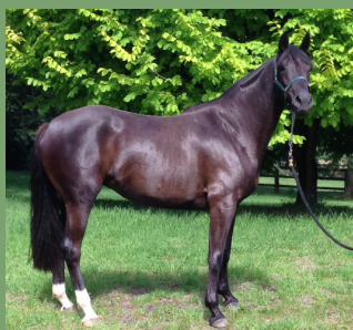
Equus Hershey 4 yo filly by Higgins out of Cooee (Calvaro) ½ sister to Echo

Equus Australia offers for sale: Two to Five Year Olds All are out of proven jumping mares with both Warmblood and Thoroughbred jumping lines.