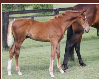
Quantum x Carinjo colt - SOLD