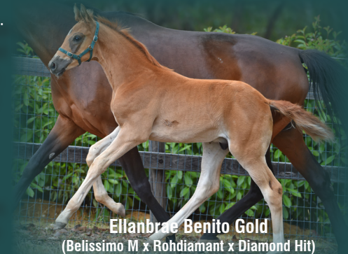
Ellanbrae Benito Gold

We currently have foals and youngstock available by Jazz, De Niro, OO Seven, Charmeur, Everdale, Bellissimo M, Dante Weltino, Chagall D&R, Lord Deniro and Hilkens Nougat Cream. Save the cost of flying your new horse from Europe and come and see what we are able to offer here in Australia.