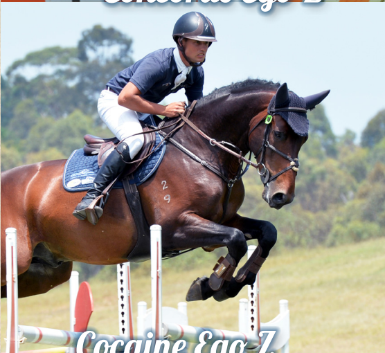
Cocaine Ego Z