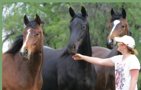
Two year olds growing up in the Hunter Valley