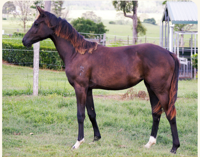
ARNAGE SENSATION (Sporcken/Desperados/Rotspon) Born 26/10/14