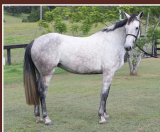
Cassini II x Caletto I mare - SOLD