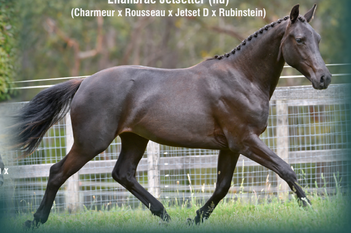
Ellanbrae Jetsetter (iiu)

(Chagall D&R x Rousseau x Jetset D x Rubinstein)