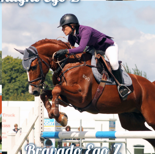
Bravado Ego Z