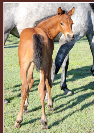
Casall ASK x Clearway colt - SOLD