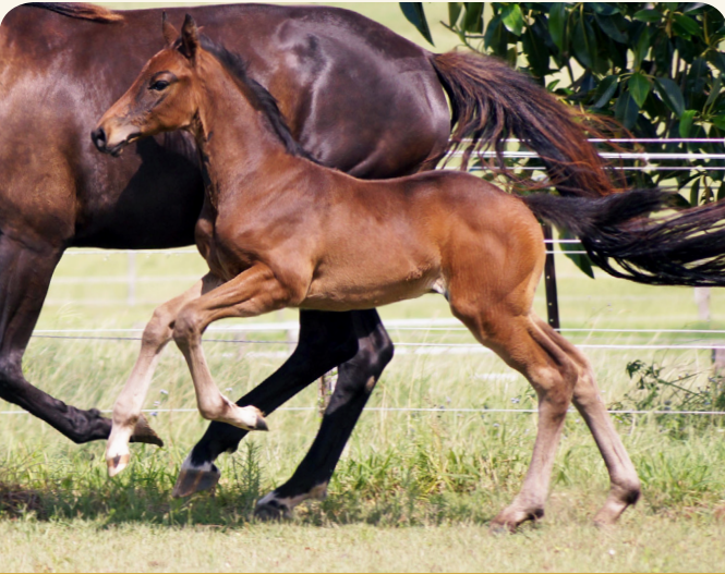
ARNAGE FÜRST CHOICE (Fiderfürst/Quintender/Compliment) Born 18/10/15

Contact Madonna Hedberg on 0427 734 682 www.arnagewarmbloodstud.com.au