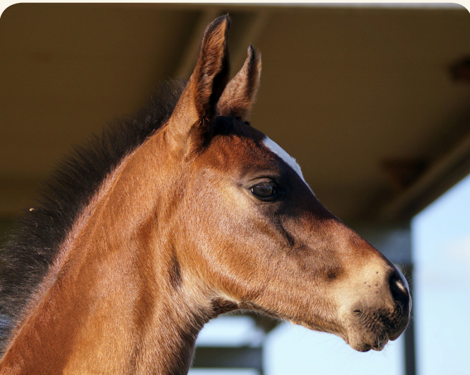
ARNAGE FOREIGN AFFAIR (Fiderfürst/Royal Classic/Don Crusador) Born 05/12/15