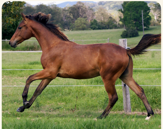
ARNAGE FOREIGN EXCHANGE (Fiderfürst/Royal Classic/Don Crusador) Born 14/12/14