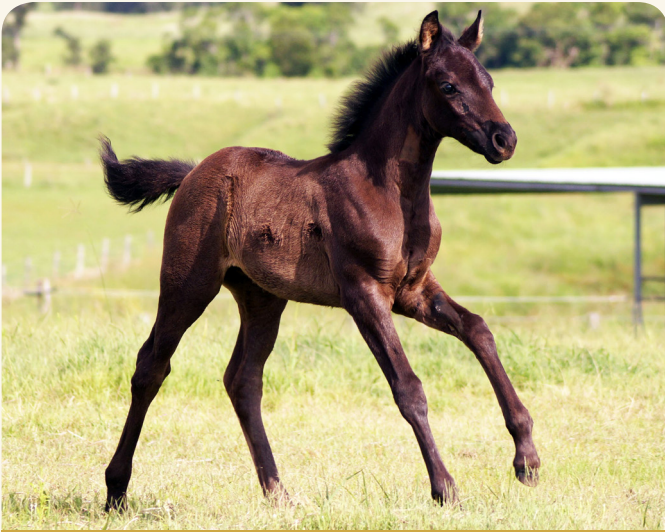
ARNAGE FASCINATION (Fürstenball/Desperados/Rotspon) Born 27/10/15